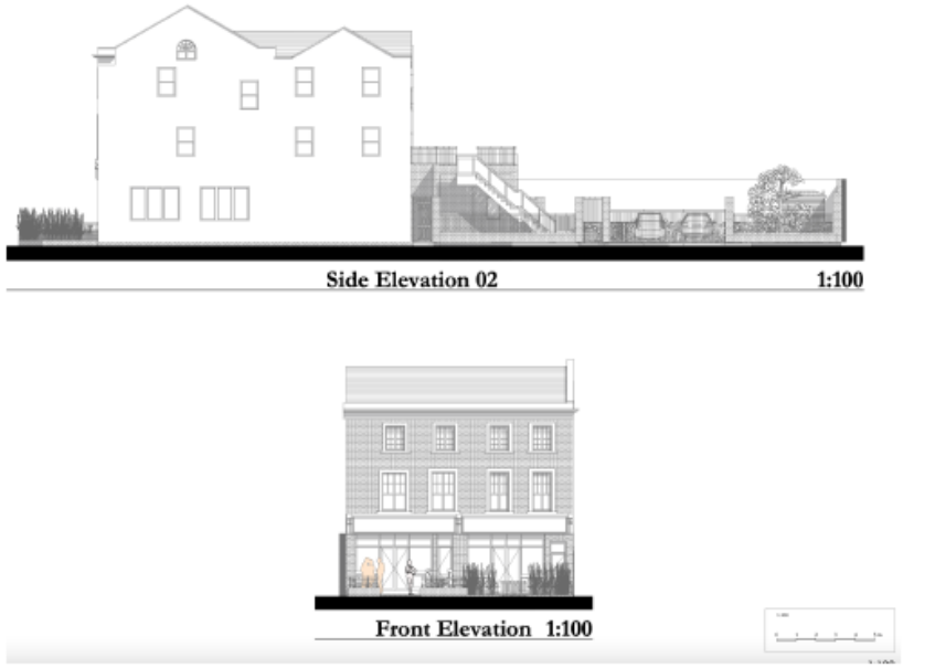
Front and side elevation of 109a from consented, and partially implemented, application 140959

Heritage Action Zone with the agent and how, if planning permission is granted, we would be looking to the new occupier to play an active part in the project. The applicant would be a tenant at the site with no control over the area outside the red line of the application site so it would be unreasonable to impose a planning condition to require that they carry out improvements to the pavement outside as included in the 2014 approved plans. However, that permission stays extant so the HSHAZ project team are keen to engage with the owner to secure these improvements to the public realm.